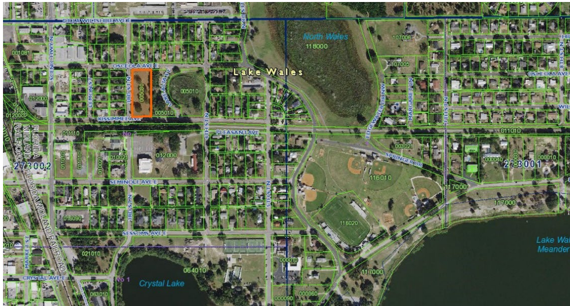
Aerial of Subject Property

ALTA VISTA PB 5 PG 12 BLK EE LOTS 3 THRU 8